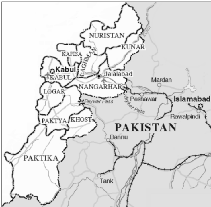
The eastern provinces of Afghanistan